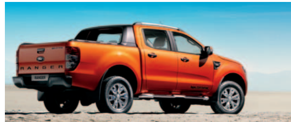
WILDTRAK Double Cab. Ebony cloth and leather trim with Journey grain. Available equipment.