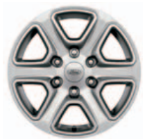
17" x 8" aluminum Standard

XLT. River Rock cloth in Catalyst pattern. Available equipment.