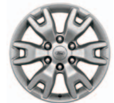
18" x 8" aluminum Standard: WILDTRAK