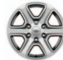
17" x 8" aluminum Standard: LIMITED

3.2L diesel I-5 engine with 6-speed manual transmission 3.2L diesel I-5 engine with 6-speed automatic transmission Daytime running lamps (RHD)